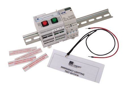
CELAELK1W- Open Pushbutton