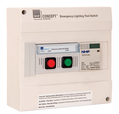
ELTSA- Enclosed Pushbutton