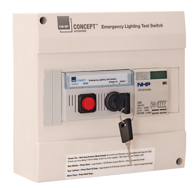
ELTKA- Enclosed Key Switch