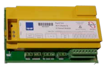
NRTMC8 - Master & 8 Channel unit