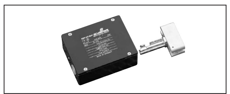
Interlock device with special actuation.