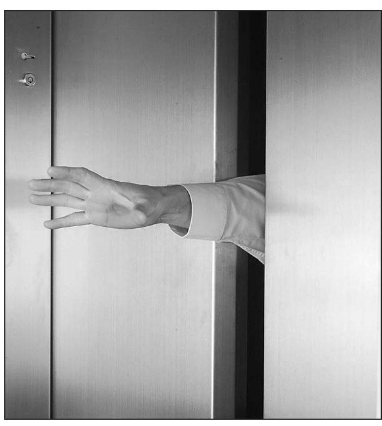
Pressure sensitive devices provide safety, but must be reliable.

Safety devices may at first seem to only offer the same function as normal machine control products. The need to consider the 'what if' situation sets a different standard of performance and not only the design of the individual component, but also the machine function and method of operation needs to be considered. At the device level the safety product must first of all not introduce a hazard itself. It must be tamper resistant and not expose the operator to mechanical or electrical hazard.