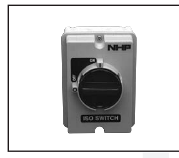
An isolator must positively remove all power from the machine.

An isolator must positively remove all power from the machine and either be next to the isolated item, or if remote provided with a padlocking facility. It is intended to allow maintenance processes to be preformed in safety as distinct for operational access.