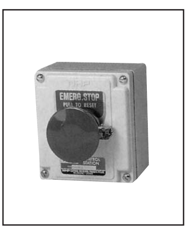
Emergency stop pushbutton station.